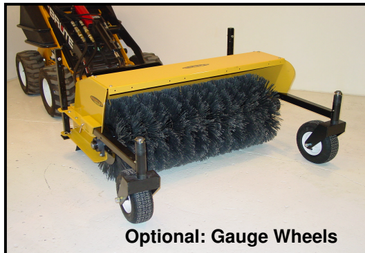
Optional: Gauge Wheels