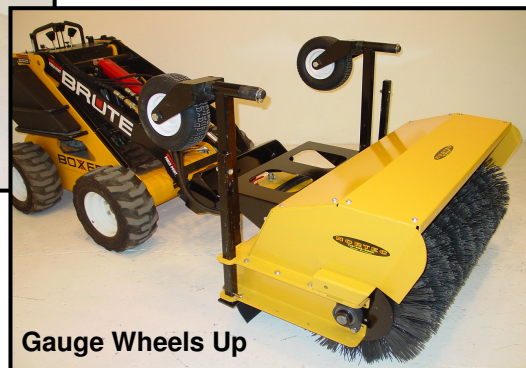
Gauge Wheels Up

Exclusive Flip-Up Gauge Wheels, ProSWEEP Technology