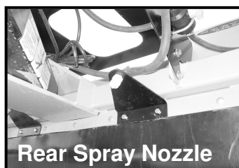
Rear Spray Nozzle