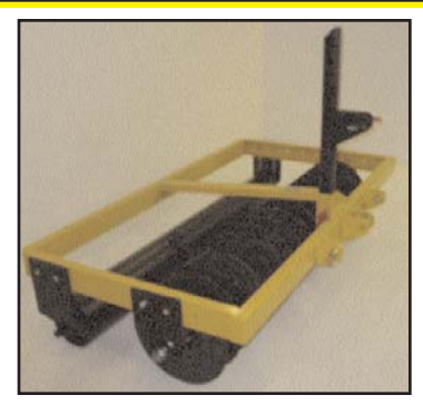
Quick-Flip Hitch Convert from tractor to ATV/utility vehicle simply by pulling a pin and